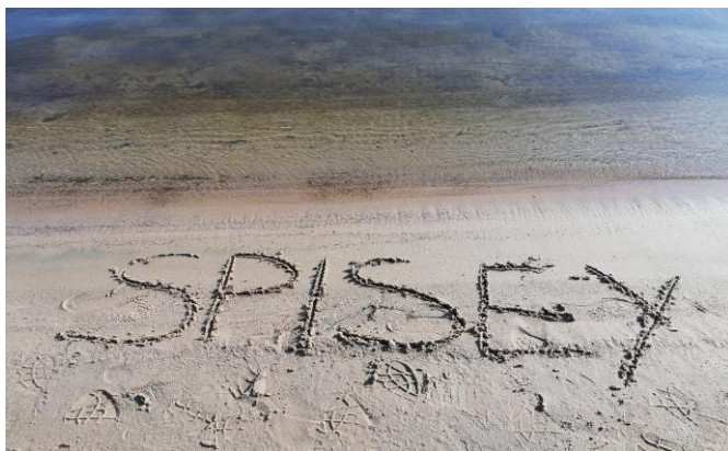
Project memory from meeting in Finland

The SPISEY partners will present the European Inclusion Compass and the facilitation toolbox and experts within the field will bring the newest European knowledge and experiences to the audience.